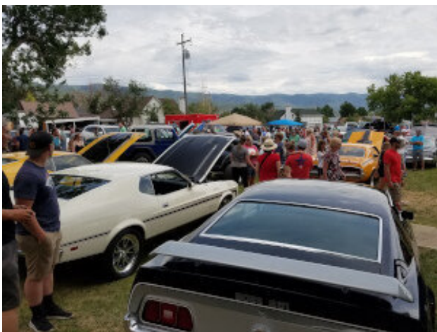
Over 90 cars were displayed at the Classic Car Show.

It was our best Pioneer Day celebration ever at the Fairview Museum, and we look forward to an even bigger and better activity in 2023!