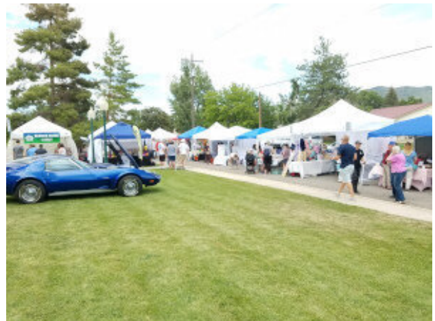
New for 2022, the Artisan Fair was a big hit.